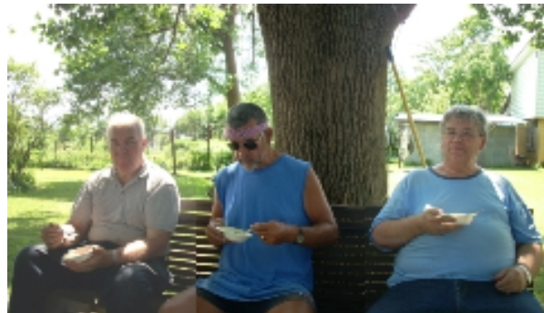
Eating the rewards. With a little copying, cropping and pasting we got all three of these guys into one frame