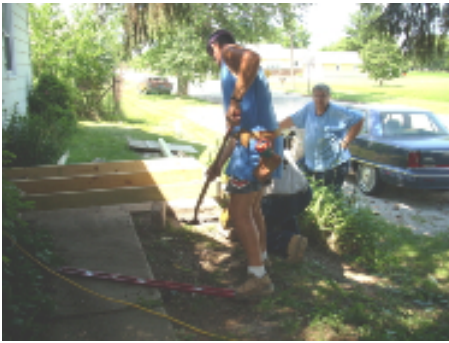
Preparing the platform extending the porch.