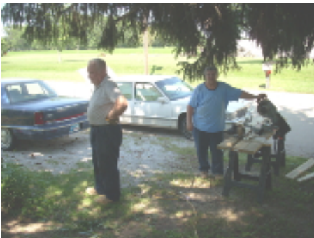
Measure twice, cut once, making sure it fits.