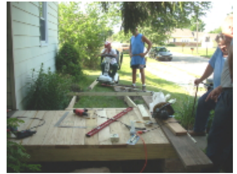
Honey Bear watching all of the work.