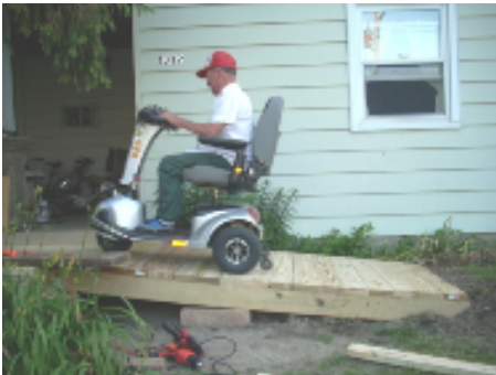
Honey Bear made several trips up and down the ramp to make sure it worked!