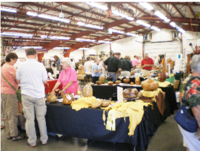
Happy vendors and customers!