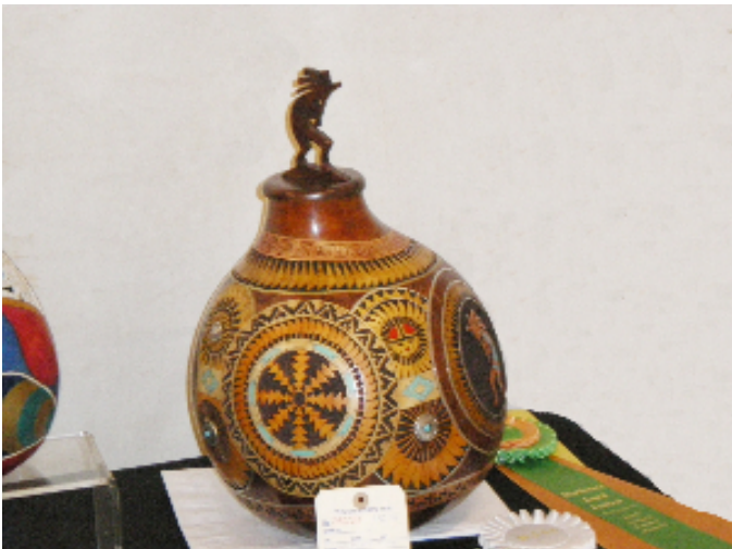
Another entry with a nice looking ribbon beside it.