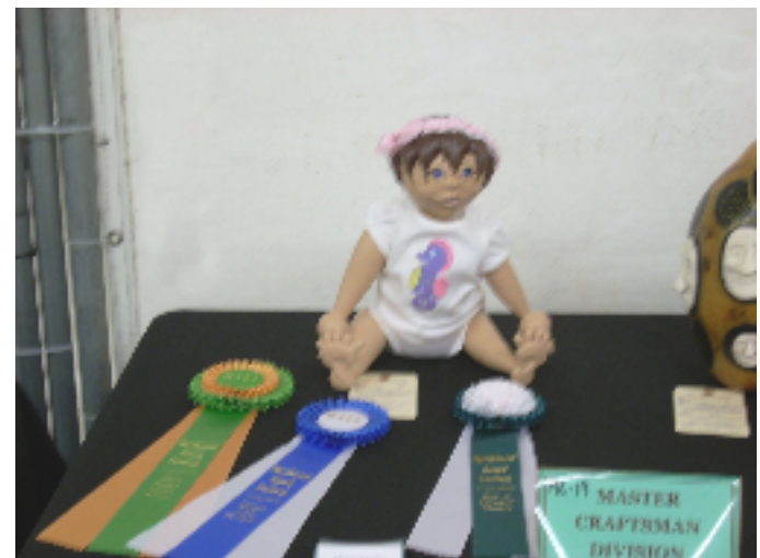
The body of the doll in this photo is made entirely of gourds. Even the toes are individual gourds or pieces.