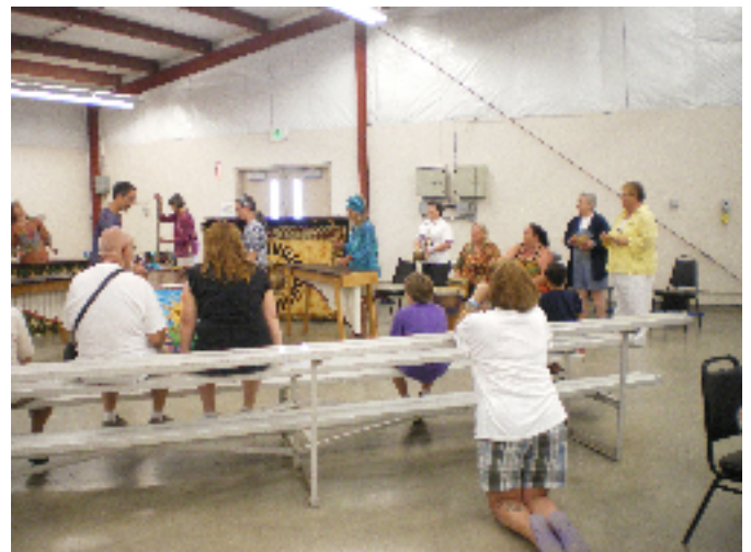
The crowd is listening some light music.