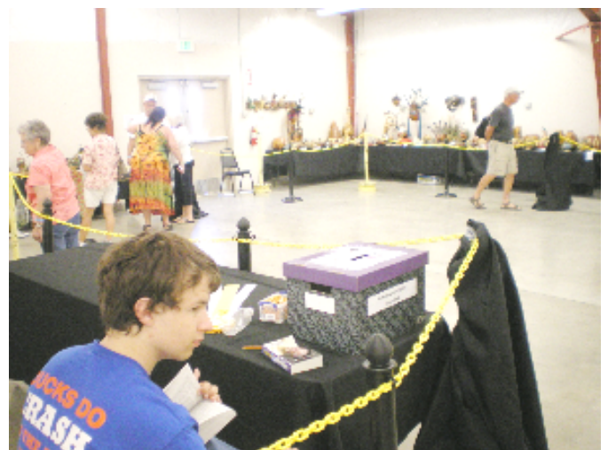
A shot across the room to show the size.