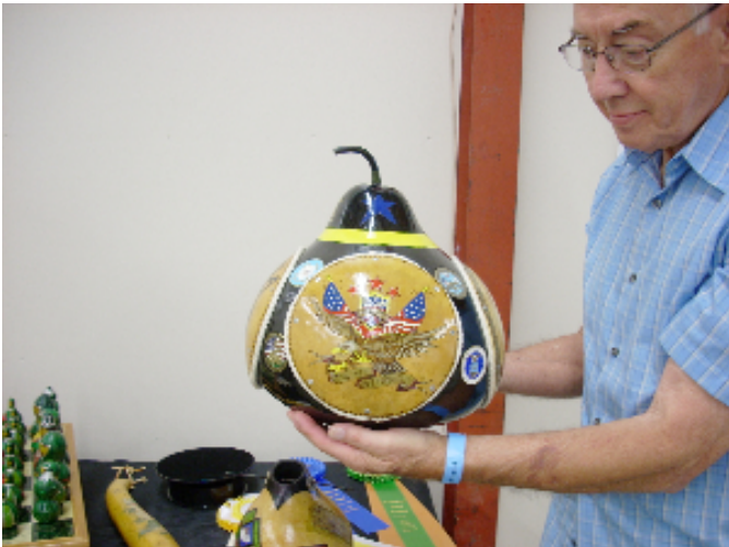
Handlers were available behind the rope to show attendees a closer view of any piece the wanted to see.