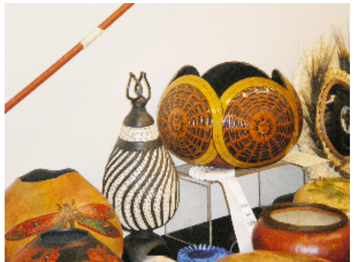
Some very nice pieces, many with a "western" theme.