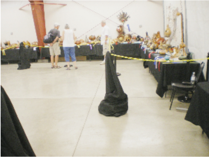
For a young society, not a bad showing of entries.