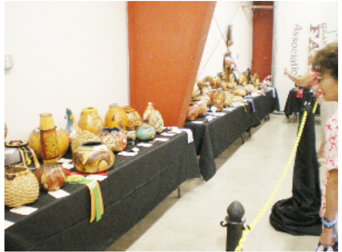
Getting a bit closer helps to show detail, but notice the rope barrier. The didn't want people to handle the entries.