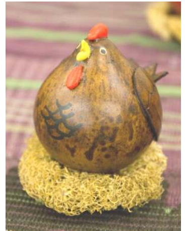
OH! I just can't wait!