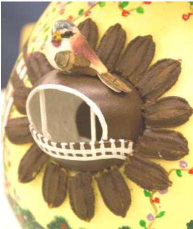
Just "Tweeting" my friends!