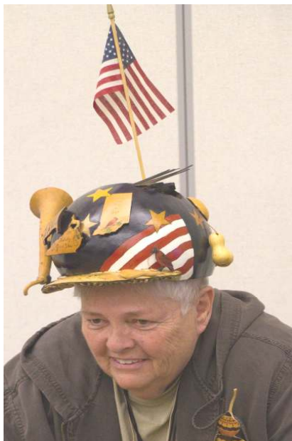
Never doubt Hoosier Patriotism