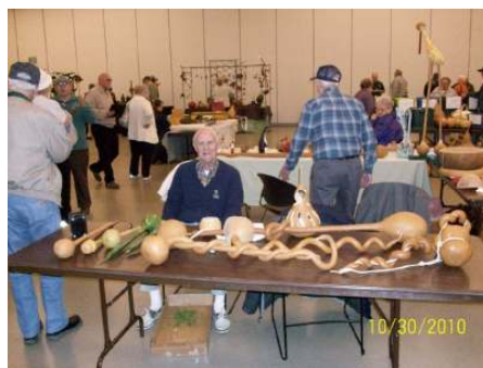
BASICS: Gourd Manipulation