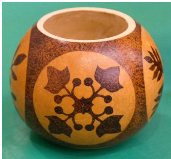
Designs in the Round!