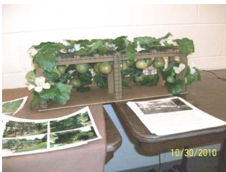
BASICS: Build A Gourd Arbor