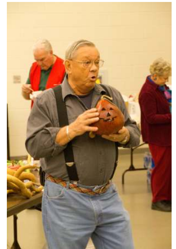
Who said $50.00?