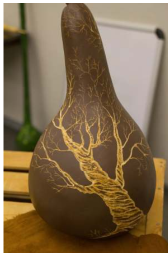
Picture this! Halloween walking by the old graveyard with spooky tree and an un-seem owl hooting at you!