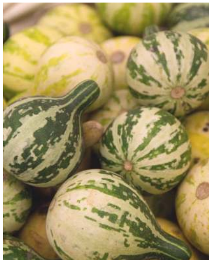
Are these under the hen?!