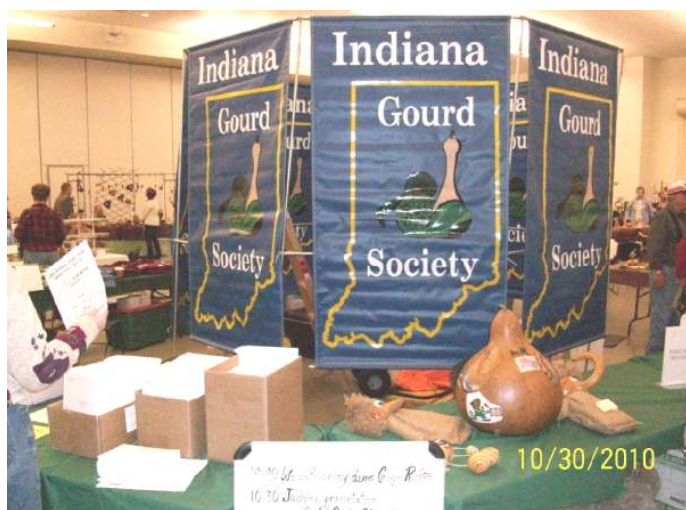
Just inside the doorway to the show was our Information and Membership information along with our State Show booklets for members to pick up.