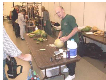
BASICS: Green Cleaning