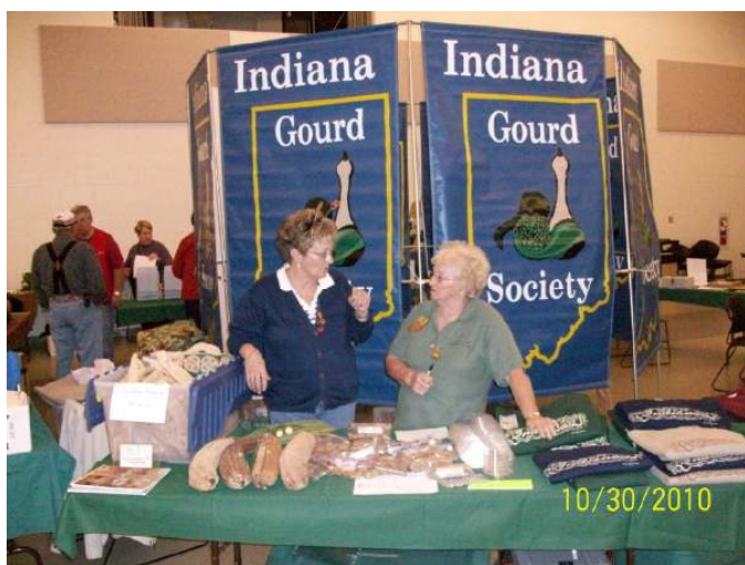
The new "monster" octagon surrounded by all things IGS – Ways & Means, Seeds, Edu. Articles, and Membership attracted both customers and comments.