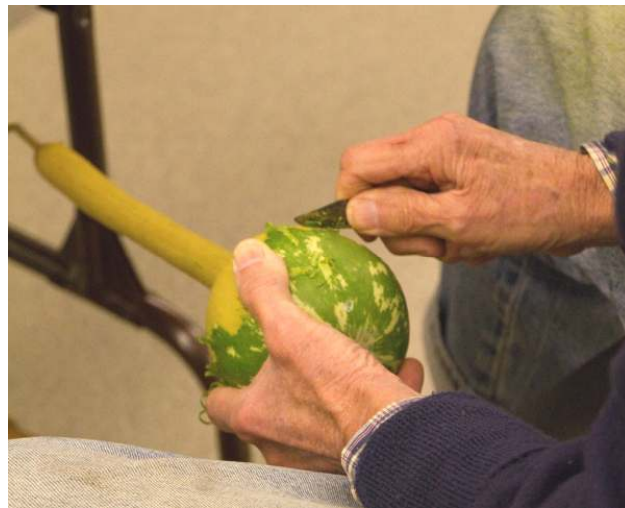
First Rule! Don't cut the thumb or fingers!