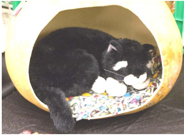
Really, get that light & camera outta here!