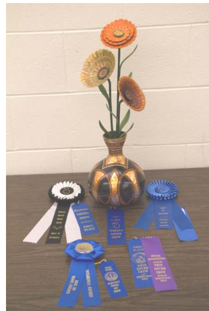
WOW! Best of the Best!