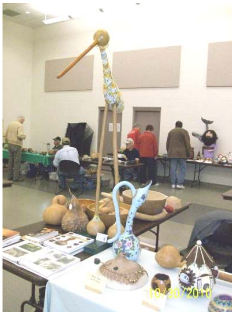
Big bird's cousin Gourd Bird visited!