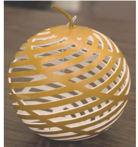
More designs in the round!