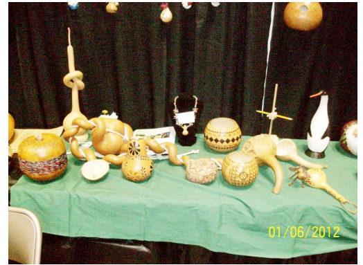
Thank you, customers and attendees!

For as small as this show was we were busy talking to people most of the time. Our booth seemed to be bursting at the seams at times with volunteers and attendees in the booth perimeter.