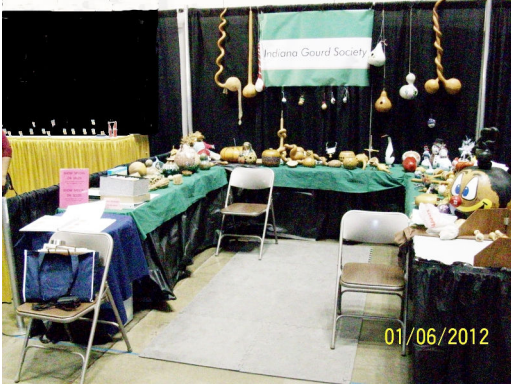
Thank you, volunteers!