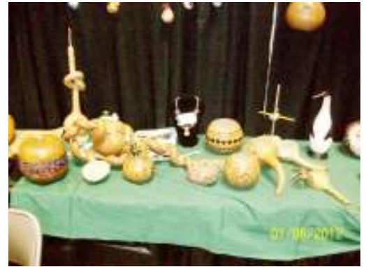
Thank you, customers and attendees!

For as small as this show was we were busy talking to people most of the time. Our booth seemed to be bursting at the seams at times with volunteers and attendees in the booth perimeter.