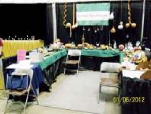
Thank you, volunteers!