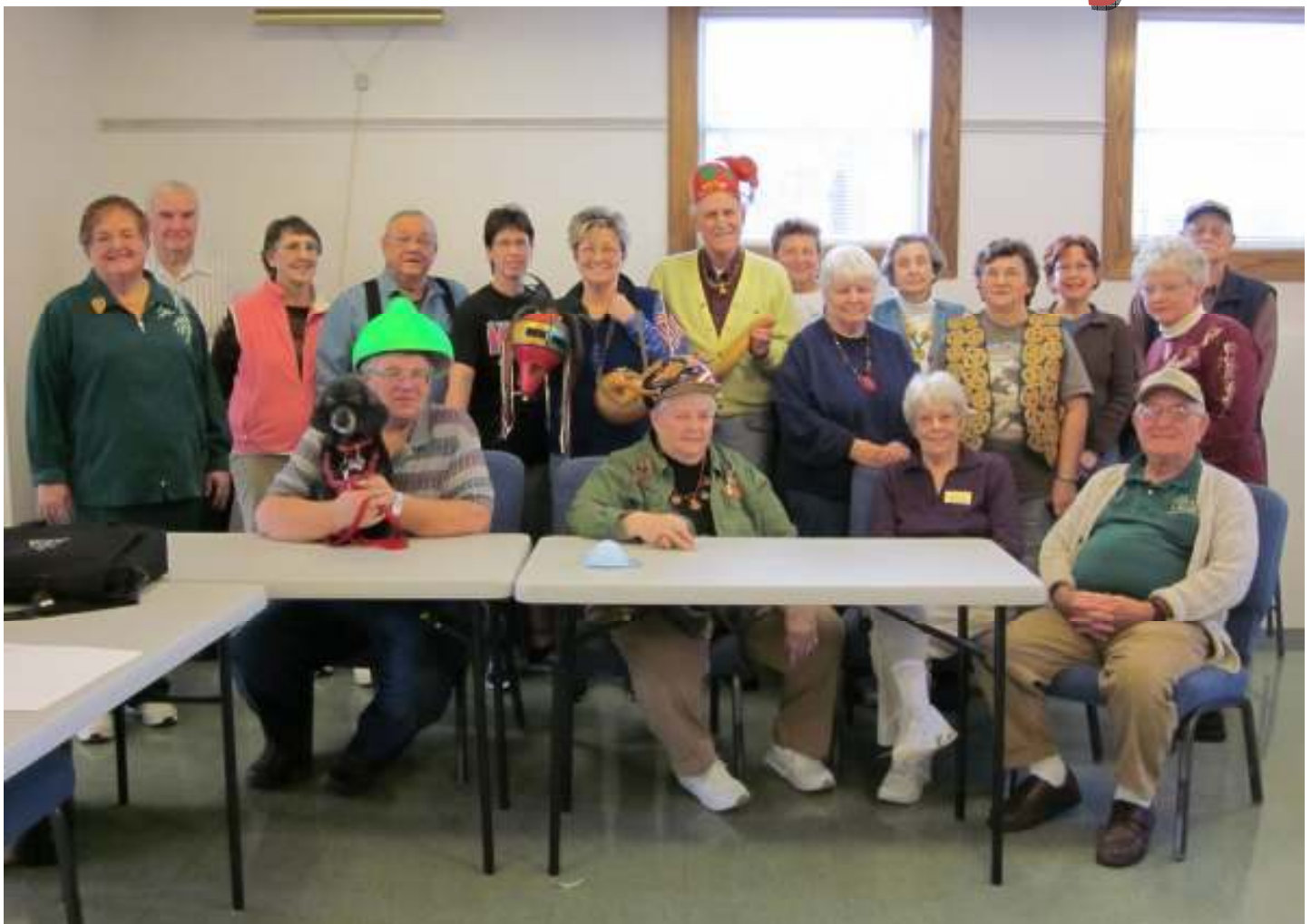
The gang from our Seed Harvesting Day—2012 get-together.