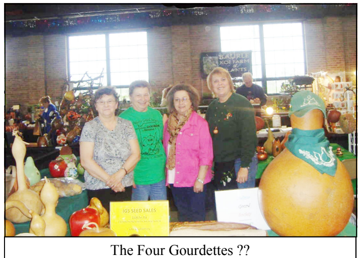
The Four Gourdettes ??