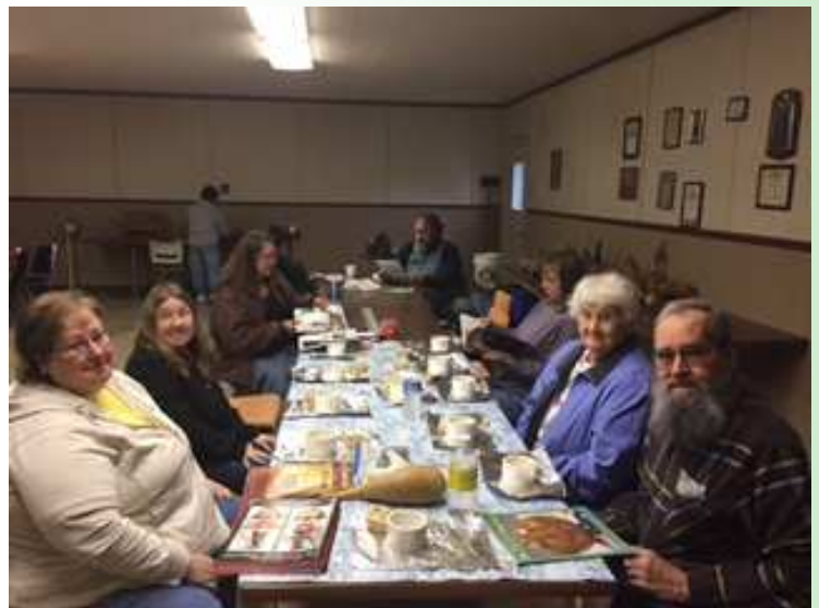
Gourd Crafters meeting