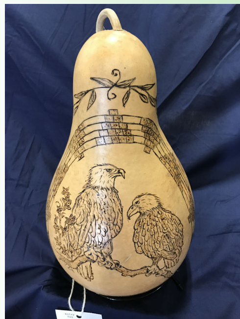
2017 State Fair Champion Central Indiana Gourd Patch

Meeting plus review of the site for the state show