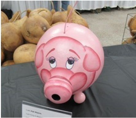
This little piggy was so heart-broken when she found out you were not there