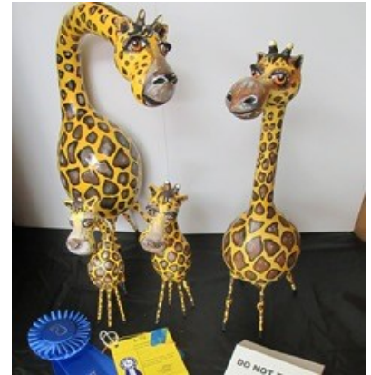
We stuck our necks out hoping you'd be there